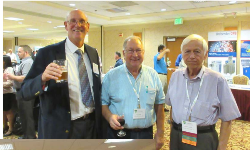
Wine & Cheese Reception