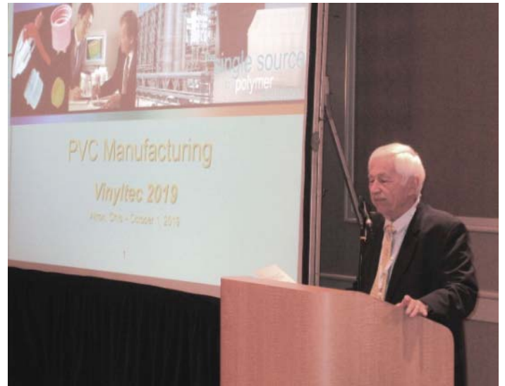
PVC 102 Workshop